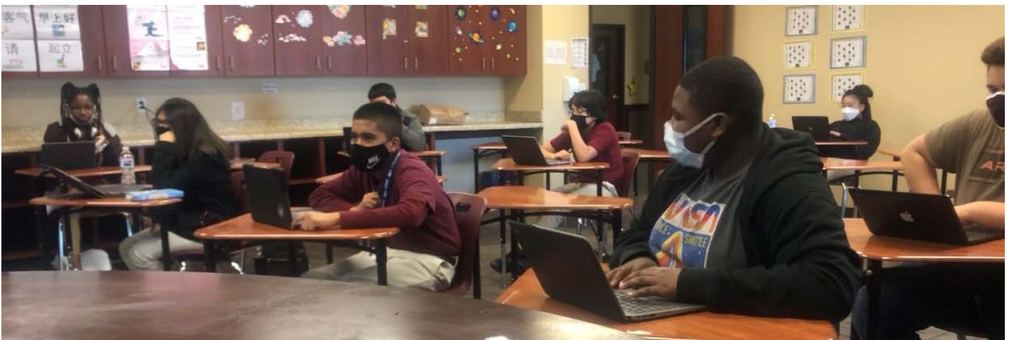
Studying Chinese in Fort Worth, Texas.

The ALC Master’s Program in Teaching Chinese was established in 2008. Our graduates have been very successful in the job market, as evidenced by four recent (or soon-to-be) graduates listed here. Congratulations to all!